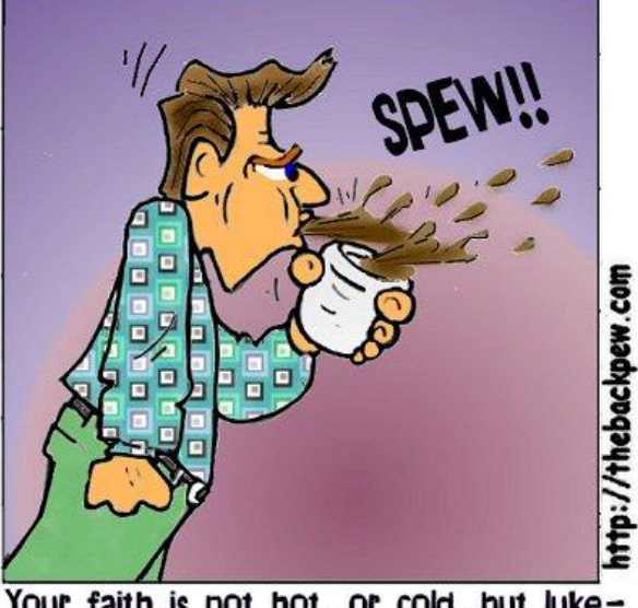
Your faith is not hot, or cold, but lukewarm. So I will spit you out like room temp 'church' coffee. Rev. 3:14-27 (The church of Laododa)