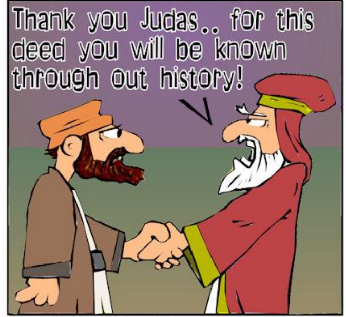
THE PRICE OF BETRAYAL.. 30 Pieces of silver bought Judas.. INFAMY! Mt. 26:15, Mk 14:10-11