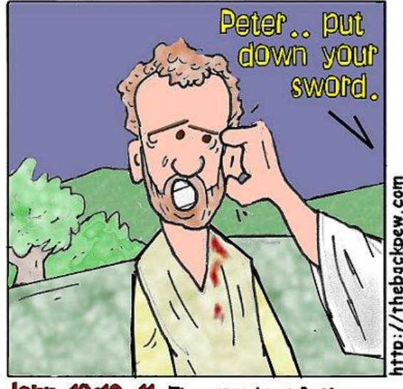
John 18:10-11 The panic of the night of Jesus arrest.