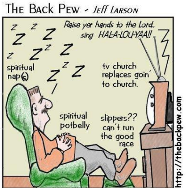
A Spiritual Couch Potato When you are spiritually well-fed, well-read but in need of a little Spiritual Exercise (volunteer in the community, at church, help you neighbor.) Matthew 25:31-46, James 2:16