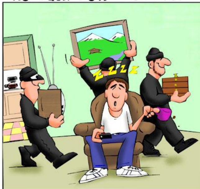
Like a Thief in the Night! Mat 24:36-42 Are you ready for Jesus Return?..