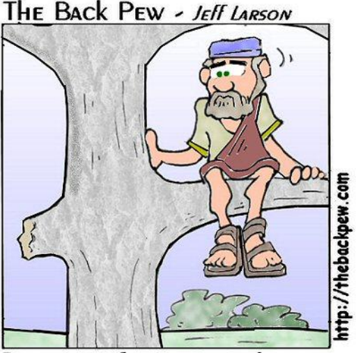
The story of Zaccheus in the Sycamore tree would have been the story of Zaccheus and Lou if it were not for the weak branch Lou was perched on. Lou was not a wee little man. Luke 19:1-9