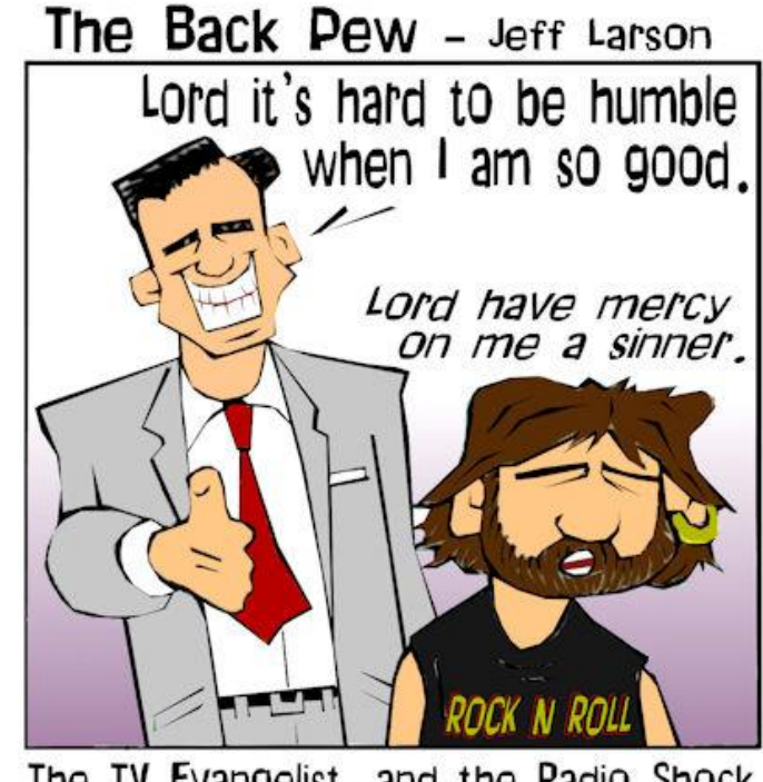
The TV Evangelist, and the Radio Shock Jock. Luke 18:9-14