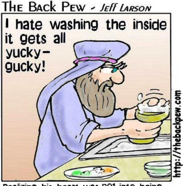
Realizing his heart was not into being a dishwasher, Phil turned to a career at the Temple where the standards were not so high. Luke 11:39 mt 23:26

[2N] In Matthew 23:34 who are the "prophets, wise men and scribes" mentioned by Jesus? So what? Think & Pray _____