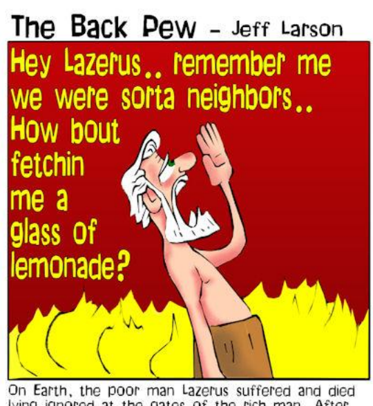
Un Earth, the poor man Eazerus suffered and died lying ignored at the gates of the rich man. After death Eazerus was carried to the arms of Abraham. The rich man lived a little SOUTH of him. Lk 16:19-31

[3M] Many people think the story of the Rich Man and Lazarus is an actual event rather than a parable because the poor man is called Lazarus. Jesus does not use a given name for anyone in any other parable He tells. Do you think this story is a parable or an actual event? Why?