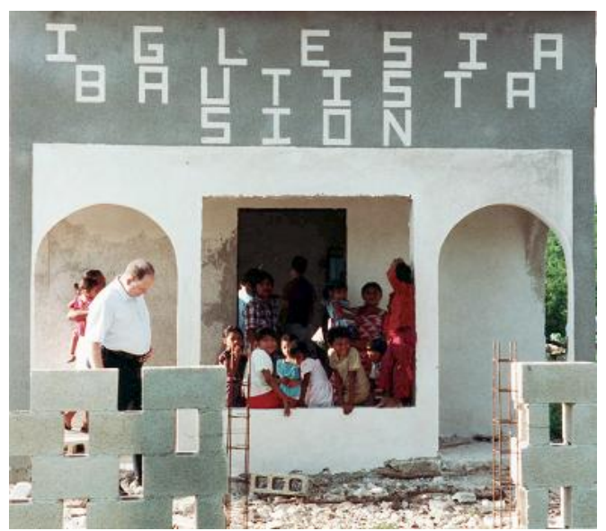
Celebrating the Sabbath in the Yucatán

Four disciples are called, Jesus attends a party with the culturally unacceptable, tells some puzzling parables and questions about the Sabbath arise.