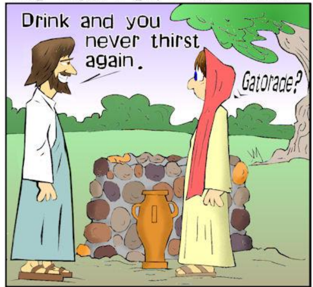
The Samaritan Woman meets Jesus at the well. JO 4:3-42

At this point the disciples return and the woman goes and spreads the Good News in her city. The people come out to see Jesus and are convinced He is Who He claims to be.