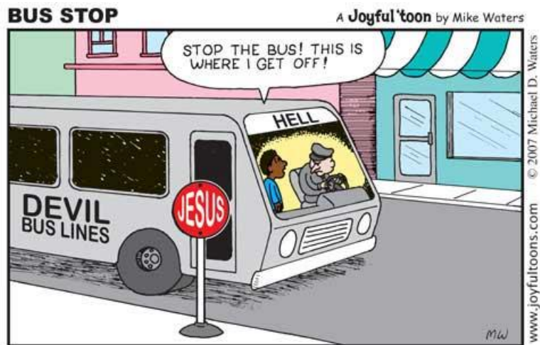
For he has rescued us from the dominion of darkness and brought us into the kingdom of the Son he loves, - COLOSSIANS 1:13 NIV

[4k] Atheist Attack: All Rich People go to Hell: Mark 10:25 Jesus said: It is easier for a camel to pass through the eye of a needle than for one who is rich to enter the Kingdom of Heaven. If you are rich, do you perceive that Jesus lied? If you are not rich, do you think this is really fair? How would you respond to this attack? (Hint 1 st Timothy 6:9-10) _____