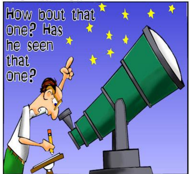
He counts the stars and knows each one. Ps 147:4 God was the original 'Astronomer'