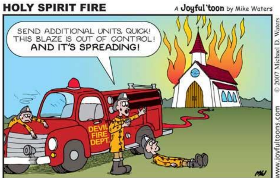
They saw what seemed to be tongues of fire that separated and came to rest on each of them. All of them were filled with the Holy Spirit... — ACTS 2:3-4 NIV