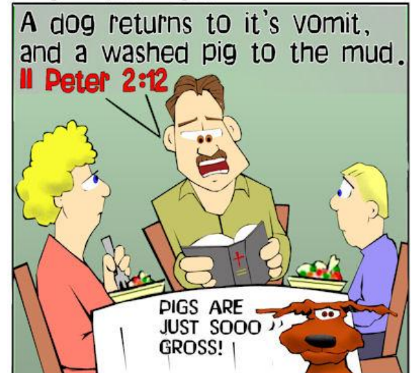
Family Devotions at dinner is a wonderful tradition. BUT using random scripture readings proved risky for the Tidbow family.