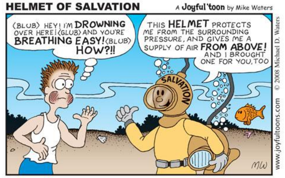
But since we belong to the day, let us be self-controlled, putting on faith and love as a breastplate, and the hope of salvation as a helmet. - 1 Thessalonians 5:8 NIV