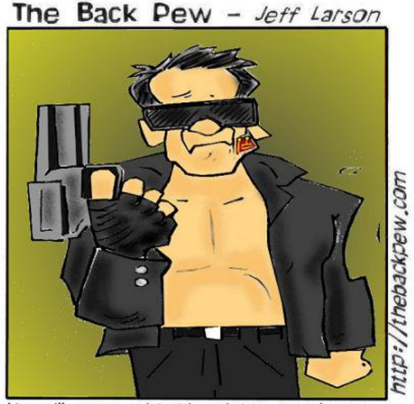
He will come with his mighty terminator angels, in flaming fire, bringing judgment on those who don't know God and on those who refuse to obey the Good News of our Lord Jesus. 9 They will be punished with everlasting destruction, I Thee 1:8,9