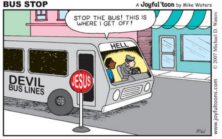
For he has rescued us from the dominion of darkness and brought us into the kingdom of the Son he loves,

[2F] We avoid being deceived by holding onto what?