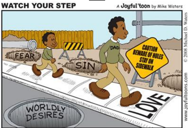
Follow my example, as I follow the example of Christ. 1 Cor 11:1