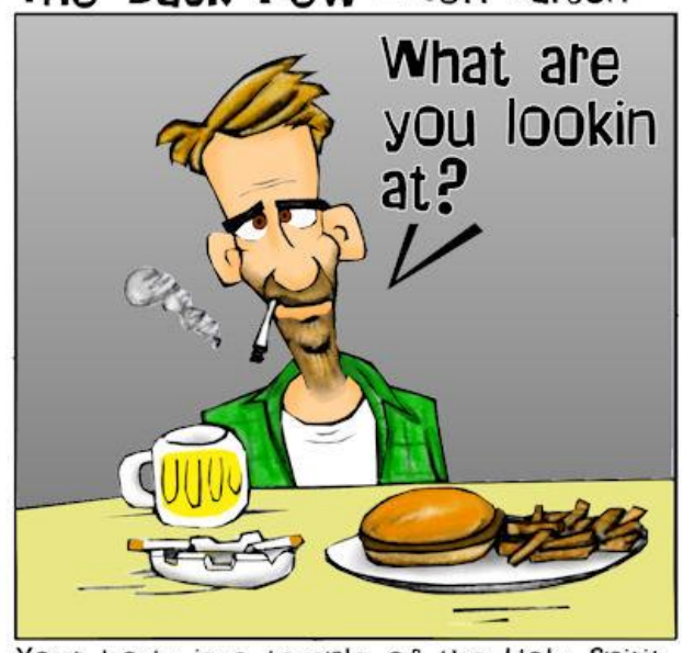
Your body is a temple of the Holy Spirit. not a GARBAGE DISPOSAL! I Cor 6:19