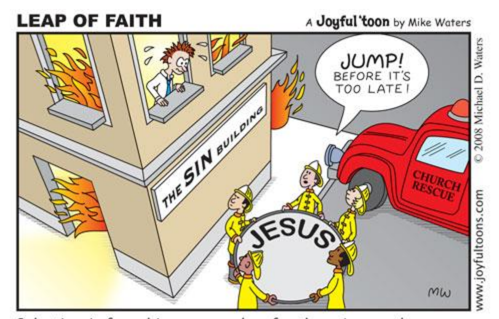
Salvation is found in no one else, for there is no other name under heaven given to men by which we must be saved.

Through a hole in the wall, he was lowered in a large basket. 9:23-31