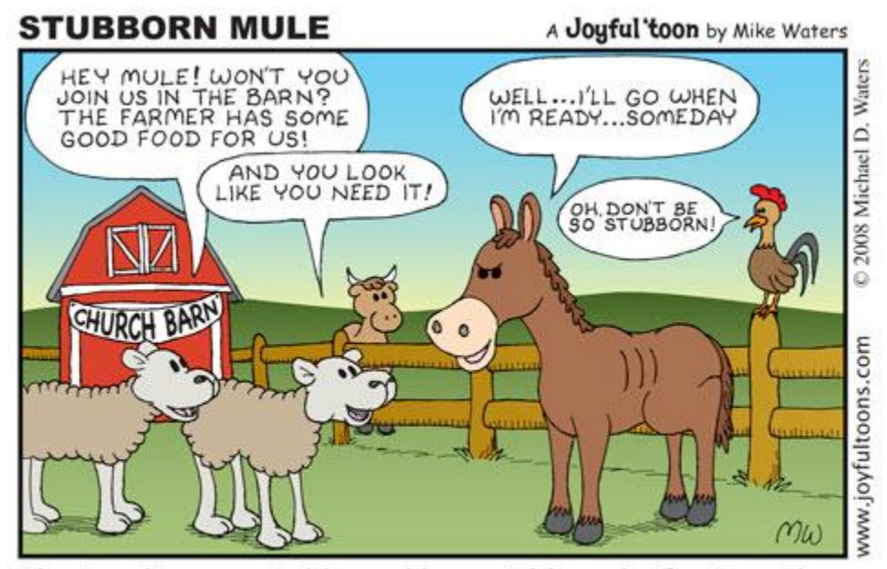
The Israelites are stubborn, like a stubborn heifer. How then can the LORD pasture them like lambs in a meadow?