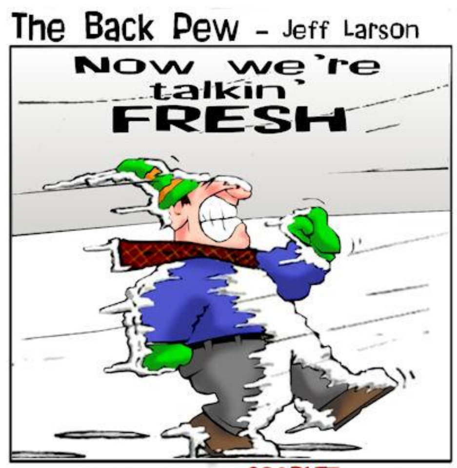
Though your sins may be SCARLET , I will make them white like a MINNESOTA SMOW, Is 1:18