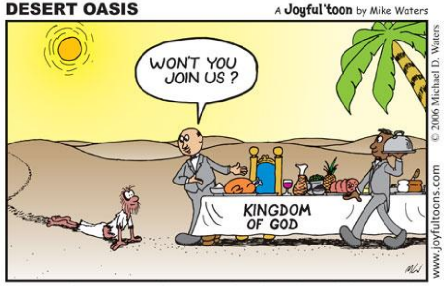
Why spend money on what is not bread, and your labor on what does not satisfy? Listen, listen to me, and eat what is good, and your soul will delight in the richest of fare. - ISAIAH 55:2 NIV