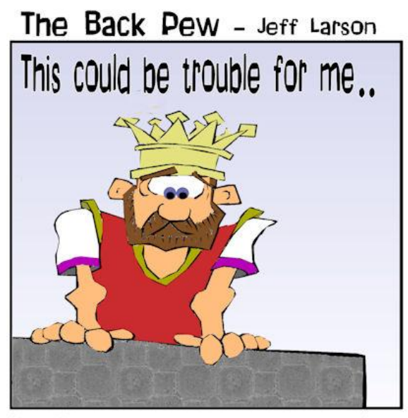
King David from the roof of the palace notices Bathsheba, and the fall of the kingdom begins. 2 Sam 11:2